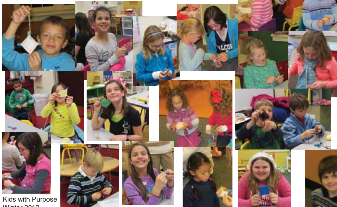
Kids with Purpose Winter 2012

From Fredericksburg United Methodist Children